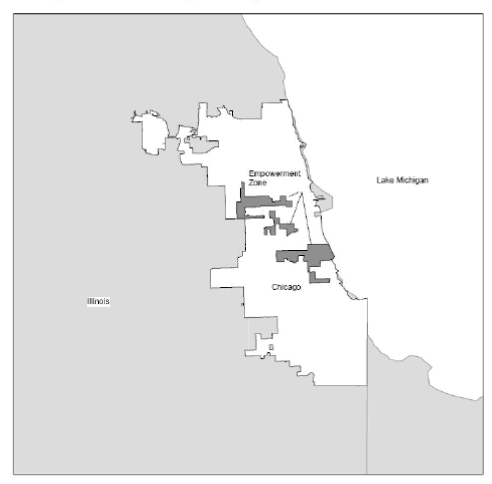
Figure 1: Chicago Empowerment Zone