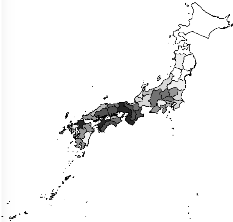
Figure 1: Geographical Density of Burakumin

Notes: The figure shows the density of burakumin (using the Burakumin variable described in Section IV of the text) within Japan. The darkest areas (Osaka, Hyogo, Wakayama, Ehime, and Fukuoka) are the prefectures with the highest density.