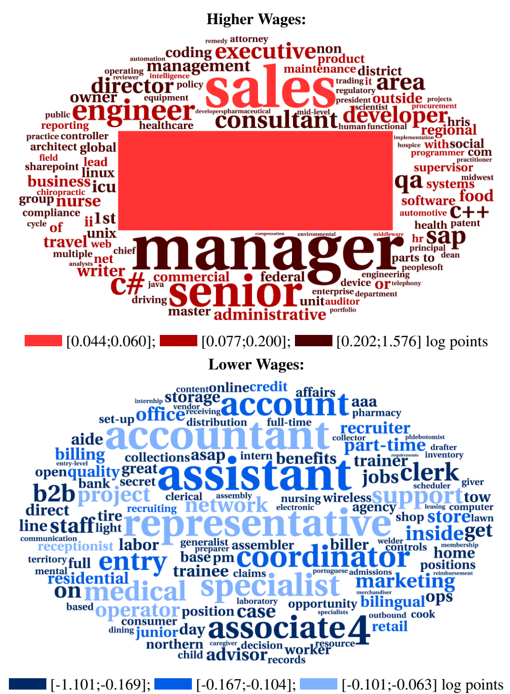
Figure 3: Words that predict wages within a given SOC code

Note: Words that are significant at the 5% level in explaining the residuals after a regression of the posted wage on SOC codes fixed effects (Table 6, column II) and appear at least 10 times. The big rectangle is "-", which typically separates the main job title from additional details. Word cloud created using www.tagul.com. The size of a word represents its frequency, while the color represents the tercile of its coefficient, weighted by frequency.