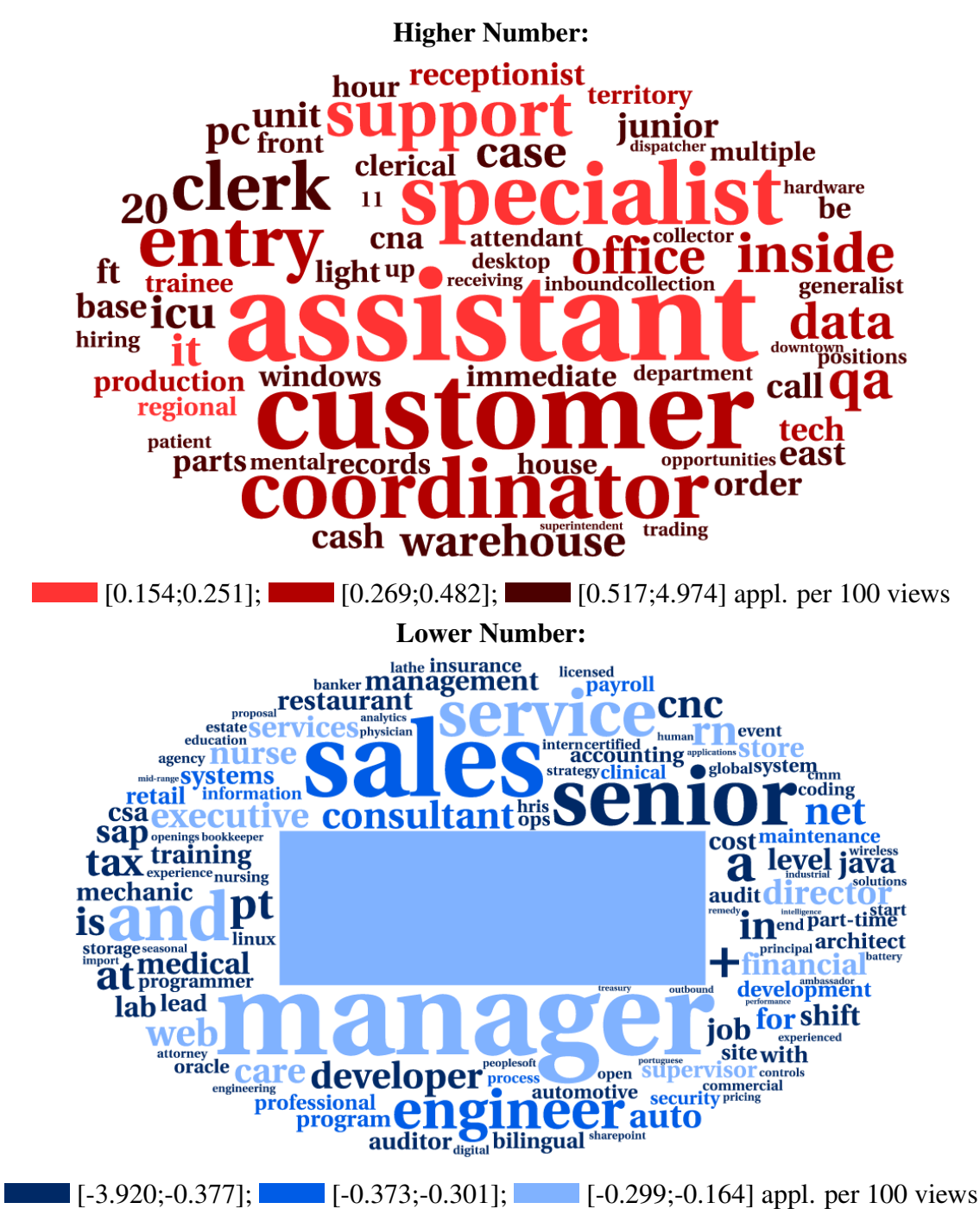
Figure 5: Words that predict the number of applicants per view within a given SOC code

Note: Words that are significant at the 5% level in explaining the residuals after a regression of the number of applicants per view on SOC codes fixed effects and appear at least 10 times. The big rectangle is "-", which typically separates the main job title from additional details. Word cloud created using www.tagul.com. The size of a word represents its frequency, while the color represents the tercile of its coefficient, weighted by frequency.