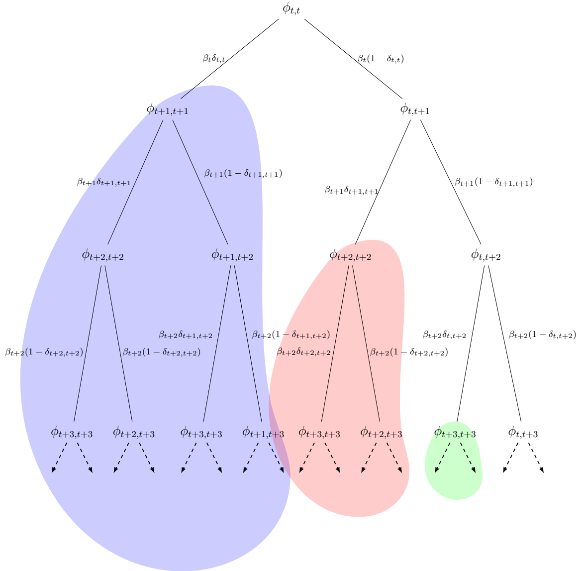
Figure 4: Present Discounted Value of Wages