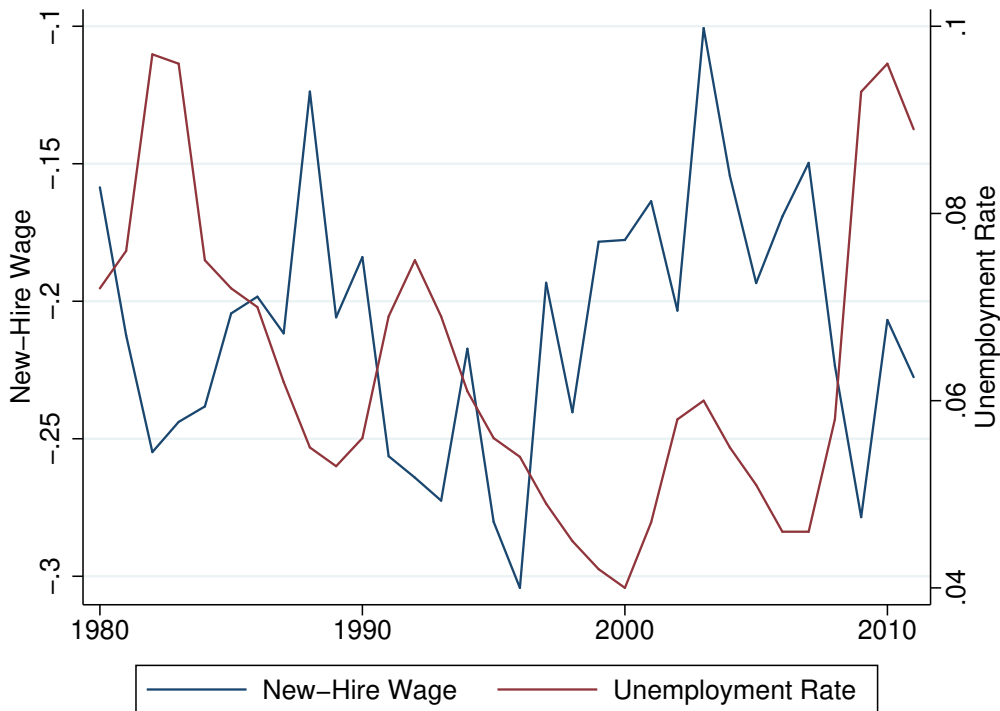
Figure 2: Time Series of the Quality-Adjusted New-Hire Wage

ment rate. The new-hire wage is clearly highly procyclical. Most notably, it decreases by about 9.2% and 12.9% for the two large recessions in 1980-82 and 2007-2009. Table 2, Column 1 gives the estimated cyclicality of the new-hire wage: The new-hire wage decreases by 2.30% for each percentage point cyclical increase in the unemployment rate, with a standard error of 0.67%.