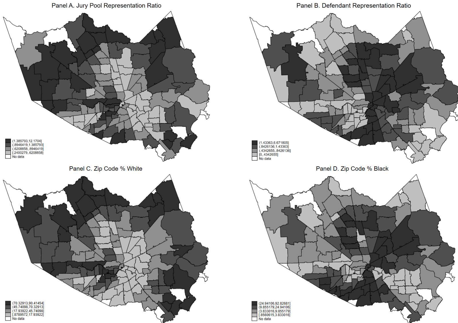
Figure 2. Harris County Maps of Zip code Race and Representation in Jury Pools and Defendant Populations

Note -- Panels 1A-1D present maps of Harris County zip codes; shape files obtained from https://koordinates.com/layer/97880-harris-county-tx-zipcodes/ . Panels A and B present representation ratios for the jury pool and defendants, while Panels C and D present the share white and black in each zip code according to the 2000 Census. In all figures, zip codes are broken down into quartiles, darker shading corresponds to higher values. These descriptive zip code quartiles do not perfectly match the quartile cutoffs defined in the main analysis, which are based on the entire sample of potential jurors (rather than aggregating those to the zip code level).