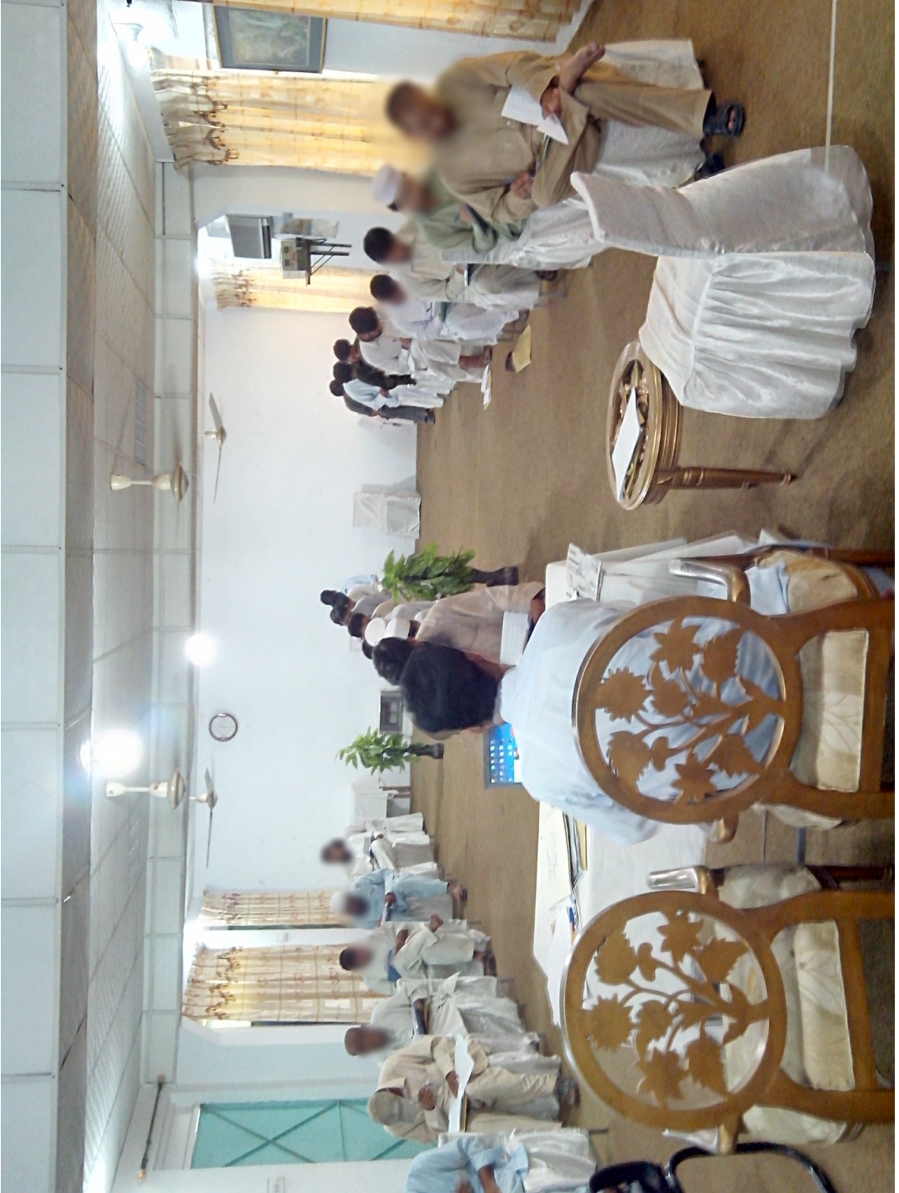
Figure A.5: Experiment Session in Peshawar