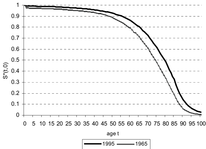
Figure 2: Survival Probabilities for the U.S. Population (from age 0 to t ), 1965 and 1995

Of the parameters and variables needed, some are common in the “value of life” literature. First, interest rates are assumed to be 3% per year, and this number is used to calculate the discounted survival functions ( S(t,a) ). The assumption of subjective rate of time preference equal to the interest rate implies constant consumption throughout life. Since we are not interested in life-cycle considerations, and this facilitates the empirical implementation of the model, it is the best way to proceed. This allows the consumption term in the willingness to pay expressions to be factored as (\varepsilon_c^{-1} - 1) c \int_i^\infty S_\theta(t,i) dt . Consumption is set to the 1965 value of total per capita consumption ($13,835, equal to private plus government consumption in 1996 US$), obtained from the Federal Reserve Board Economic Database (FED). 13 Following Becker, Philipson, and