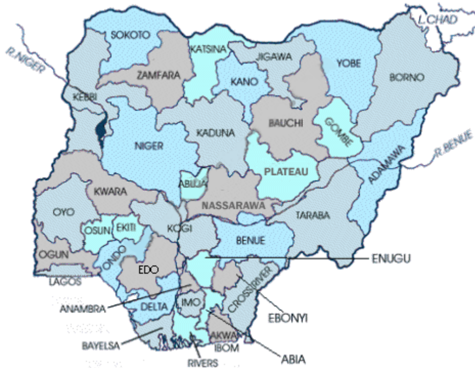
Figure 1: Map of Nigeria showing the location of Kogi and Kwara State.

The Study was carried out in Kogi and Kwara States, Nigeria. Both states are found in the North-Central Geo-political zone of Nigeria.