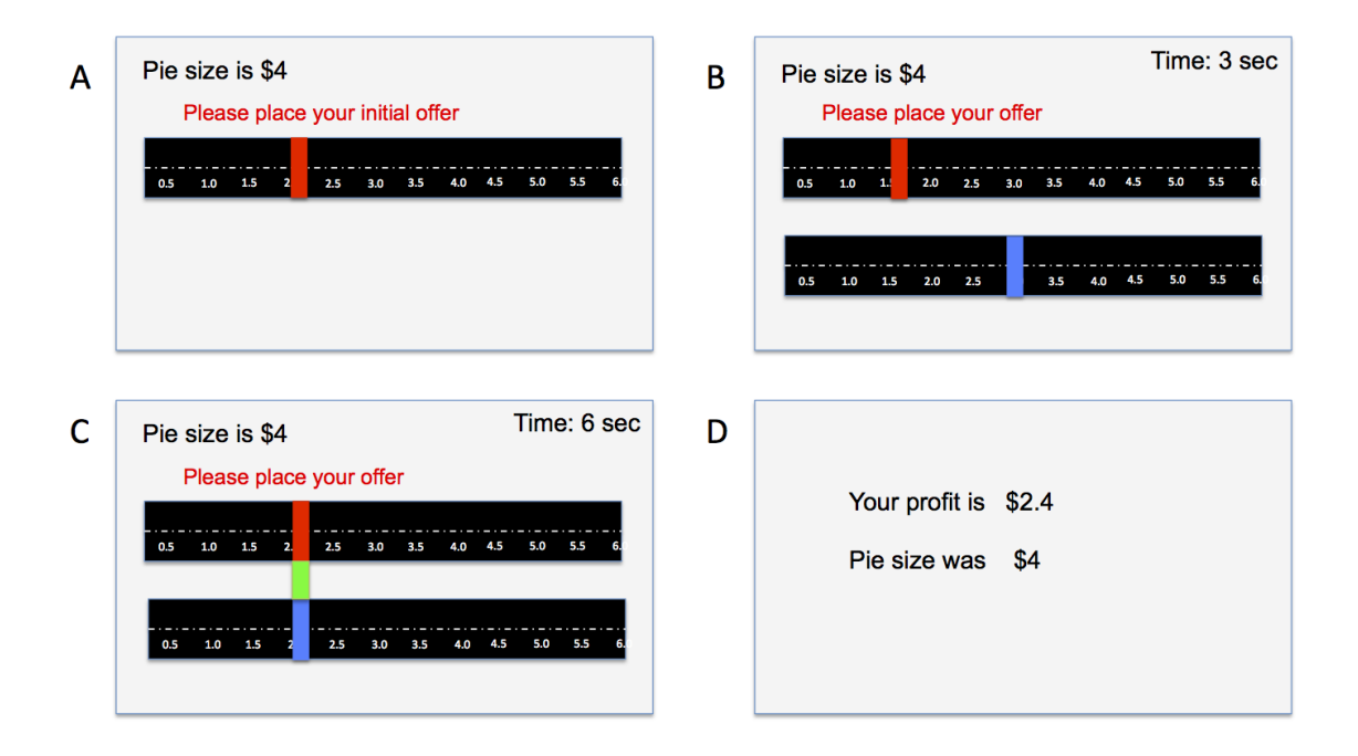
Figure 1: (A) Initial offer screen (for informed player I, red bar); (B) example cursor locations after 3 secs (indicating amount offered by I, red, or demanded by U, blue). (C) cursor bars match which indicates an offer, consummated at 6 seconds. (D) Feedback screen for player I. Player U also receives feedback about pie size and profit if a trade was made (otherwise zero).

Suppose are trying to predict whether there will be an agreement or not based on everything that can be observed. From a theoretical point of view, efficient bargaining based on revelation principle analysis predicts an exact rate of disagreement for each of the amounts $1-6, based only on the different amounts available. Remarkably, this prediction is process-free.